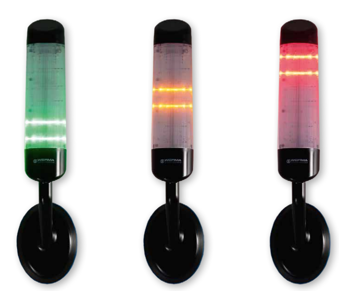
The mediclean® CPM hygiene signals based on the familiar traffic lights: The green/yellow/red system signalizes at all times whether the number of particles and germs present in the air are within the defined range.

The number of particles and germs present in the air can be measured for every operation.