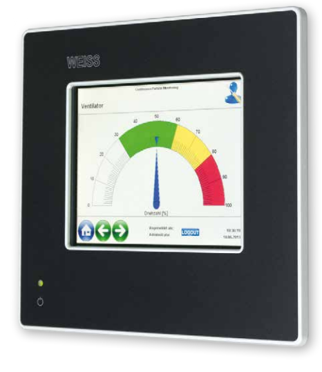
Operating panel for displaying e.g. air quantities, particle and bacterial counts.

Mediclean® CPM helps you to optimally prevent infections caused by polluted particles.