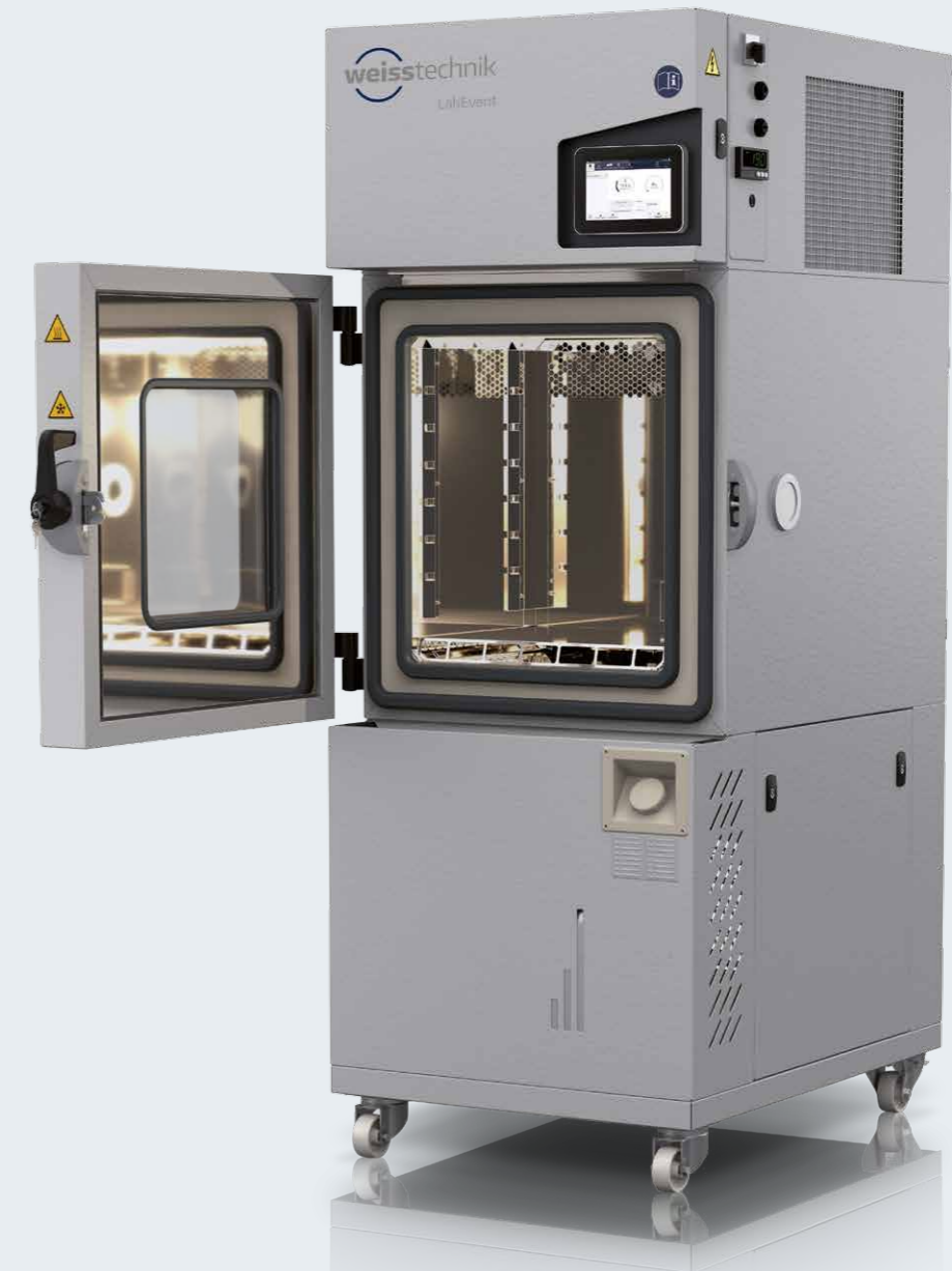
Illustration is similar, contains options

i Our innovative Test Chambers are available as weisstechnik or vötschtechnik .