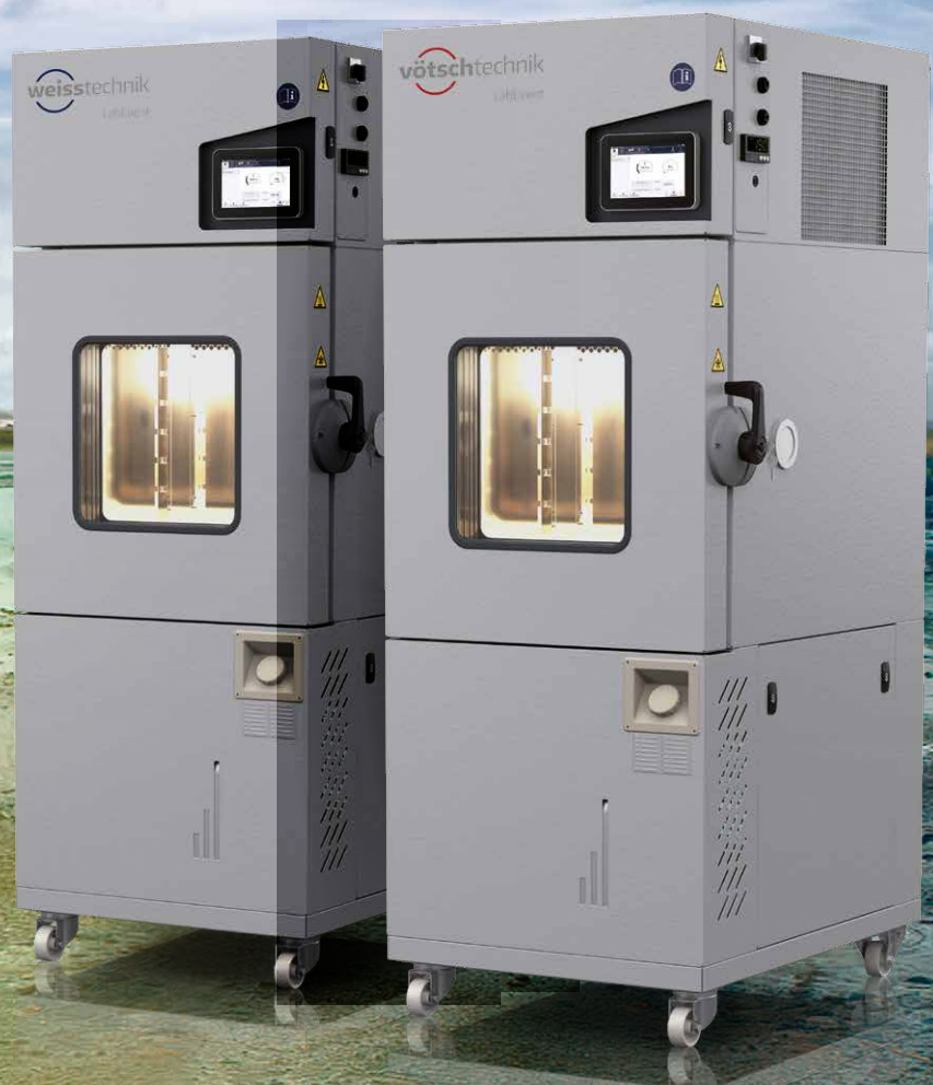
Illustration is similar, contains options